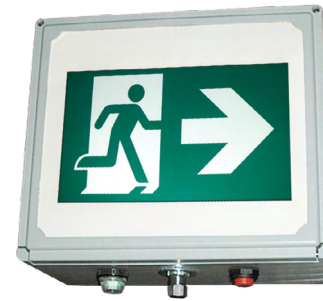
(self powered version)

CSA C860 Approved and CSA C22.2 #137 Hazardous Location Approved Class I, Division II / Zone 2, Groups C and D. CSA C22.2 #141.15 Performance Certified