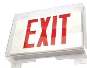
OPTIONS PG - Polycarbonate Guard